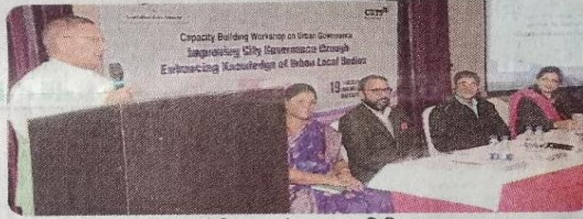
भरतपुर. कार्यक्रम को संबोधित करते मुख्य अतिथि व अन्य।