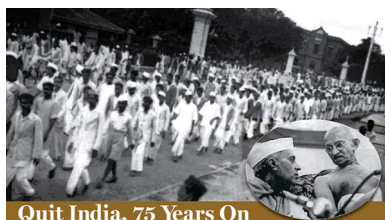
Quit India, 75 Years On